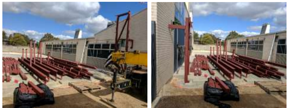
New Stem Building is taking shape

The first day back at school is Monday the 29 th of January.